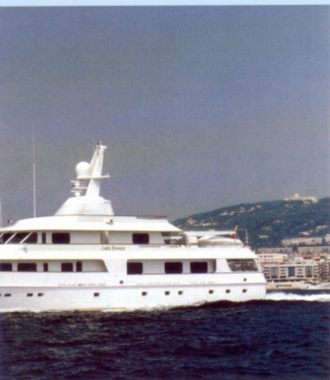
Above: A palace away from home: the saloon and dining area on-board 'Lady Duvera'. Centre: 'Lady Duvera': classic lines, superlative quality. Right: All 'Lady Duvera's' guest cabins have a private bathroom, TV and video.

with radio-room. All the exterior decks are Burmese teak-planked and a large jacuzzi, complete with two seating areas, is situated on the sundeck. More seating areas are located to the side and in front of the mast. Here there is yet another bathroom, with basin, lavatory and shower. In short, Lady Duvera more than qualifies for the term 'luxury yacht'.