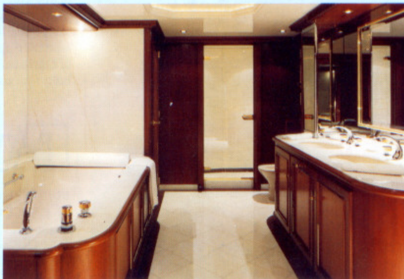
Right: The owner's bathroom on board the 43-metre luxury motor-yacht 'Lady Duvera'.

Lucky friends or associates staying in any of the four guest cabins below the sitting room/saloon can indulge themselves in Lady Duvera's many luxurious features.